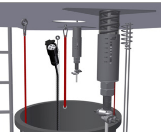
Tension Systems. The spring inside this system absorbs dynamic effets and makes it easy to adjust guide wire tension.